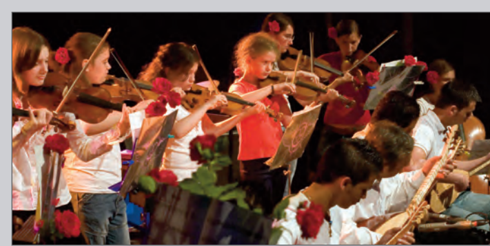
Beautiful sounds: Riehen's youth play music.(a)

Those seeking recreation in nature or have a fondness for exploring historical village centres will find an ideal location in Riehen, as will discerning lovers of art and architecture. The community is rooted in the past while at the same time being excellently prepared for the future: Riehen operates the biggest geothermal energy heating system in Switzerland and actively promotes ecological sustainability. In 2004 Riehen was the first community to be awarded the «European Energy Award Gold» for its energy policies. The community also actively engages in family and youth politics and since 2011 has become the proud carrier of the Unicef «Child Friendly Community» label. May Riehen remain a place worth loving and living in.