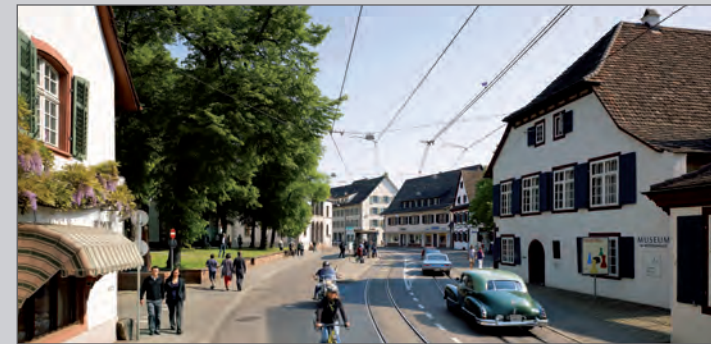
Active daily life: the historical centre of Riehen.