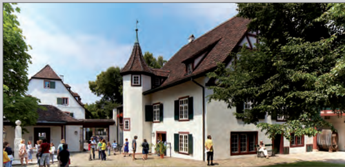
Playful exploration: the Riehen Toy Museum.