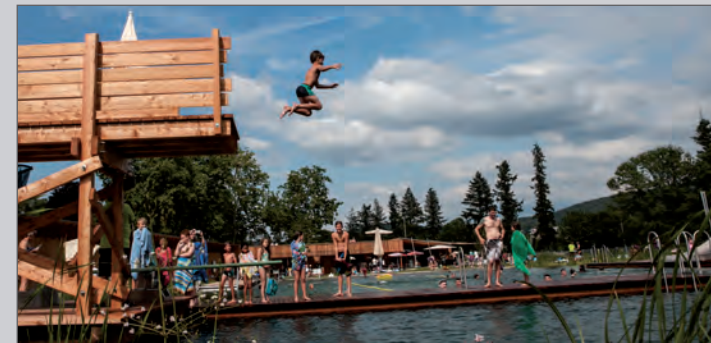
Outdoor swimming: relax and enjoy nature.