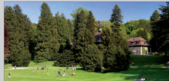
Meeting point for young and old: Riehen Wenken Park.