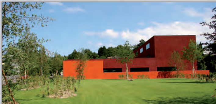
We care for our future: school «Hinter Gärten». (b)